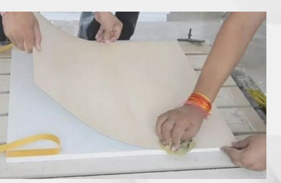
Press the laminated portion by using wet squeezed cloth to remove air entraption.

Once the tack is formed and the film turns transparent, paste the surfaces properly. Bring the laminate in contact to HAMMER EXPRESS coated ply surface and make proper alignment.